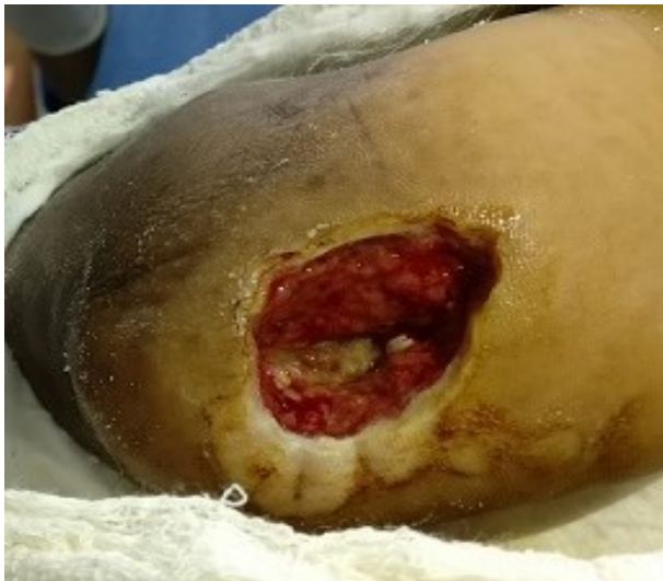
Fig. 1. 5 days post-surgical debridement.

Susceptible antibiotics were started and after 2 days surgical debridement was done and as the margins were non-opposing the wound was covered with sterile normal saline soaked gauge and below knee casting done. Further management remained the same with regular dressing through window using normal saline and continuation of antibiotics. Healthy scar tissue was seen within a period of 5 weeks. Stringent offloading regime was followed. For ambulation axillary crutches were used.