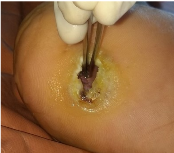
Fig. 1. Pre-operative

After 8 weeks complete healing of ulcer was achieved which was further taken care by appropriate orthosis prescription. She was given antibiotics course for the entire healing period. Patient is still in follow-up.