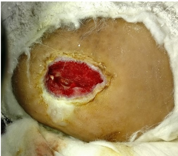
Fig. 2. Post-operative 2 nd dressing through window