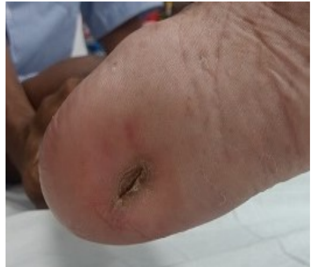
Fig. 2. Post-operative. Healed scar.