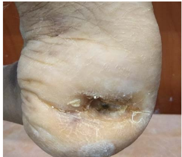
Fig. 3. Post-operative healed ulcer by scarring.