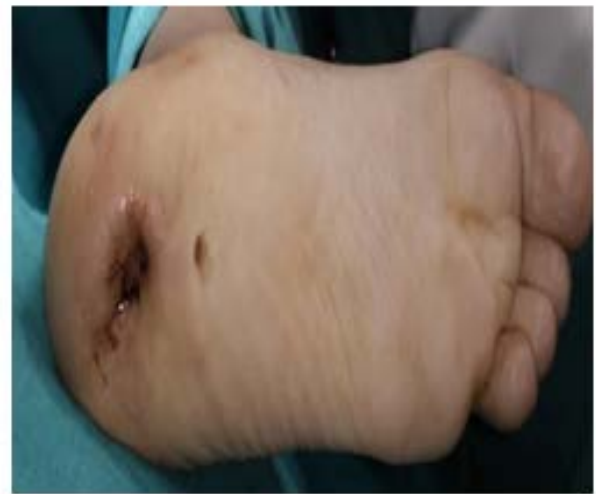
Fig. 1. Pre-operative

Ulcers completely healed by 6 weeks and sutures were removed the same time. The patient was maintained on antibiotics for complete 6 weeks and Vitamin C and zinc supplements.