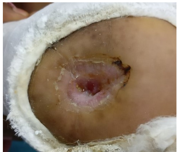
Fig. 5. Post-operative week 4