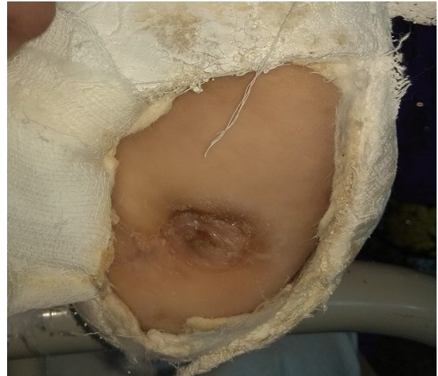
Fig. 2. Post-operative. Dressing through window in POP cast.