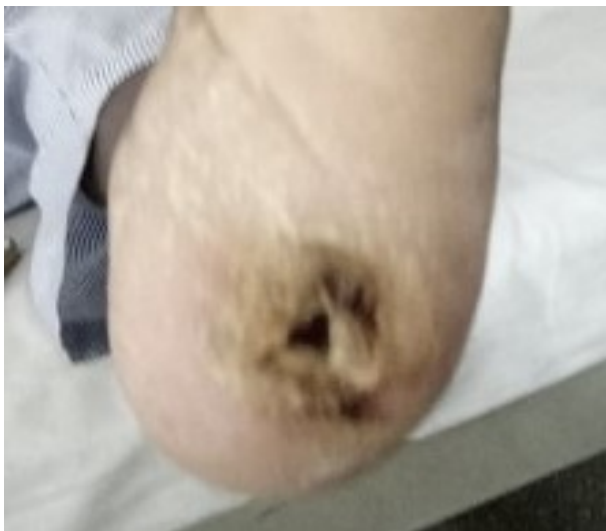
Fig. 1. Pre-operative

Management- after investigations initially the patient was given a regular dressing to clear active local infection with starting of appropriate antibiotics. As soon as he was cleared of local infection and maggots, surgical debridement was carried out and he was maintained with an open wound in a cast which was regularly cleaned and dressed with normal saline. His nutrition and micronutrient supplementation were also taken care of. Focus was to achieve healthy fibrous scar tissue on which partial weight bearing could be achieved. He achieved complete healing within a period of 2 months. Now he has been provided with moulded insole in footwear and is under regular follow up.