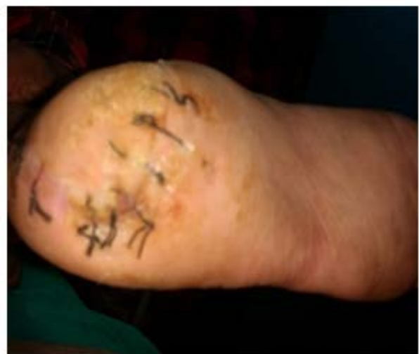
Fig. 3. Post-operative. Healed ulcer. Sutures in situ.