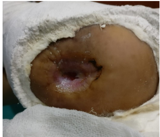
Fig. 4. Post-operative week 3.