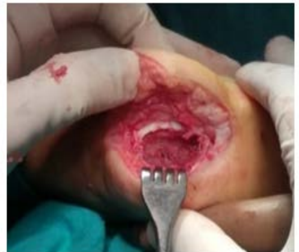
Fig. 2. Intra-operative