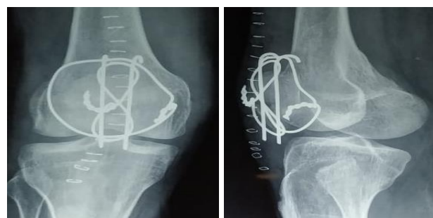
Figure 2: (A) Post-operative radiograph in (B) Post-operative radiograph in group 1 (AP view). group 1 (lateral view).