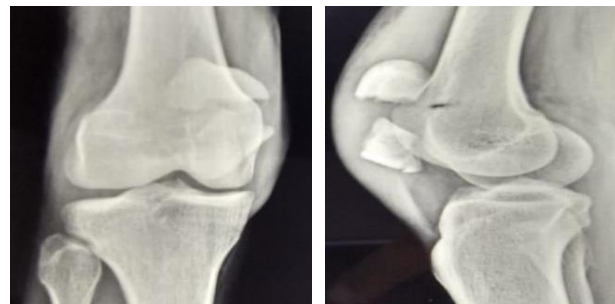
Figure 1: (A) Pre-operative radiograph (AP view). (B) Pre-operative radiograph (lateral view).

two K wires and stainless-steel wire Tension band wiring was also done. After the surgery as post operative knee brace was given so that patients could start range of motion at knee without pain. To make sure that whether proper fixation was done or not Post-operative radiographs were also done.