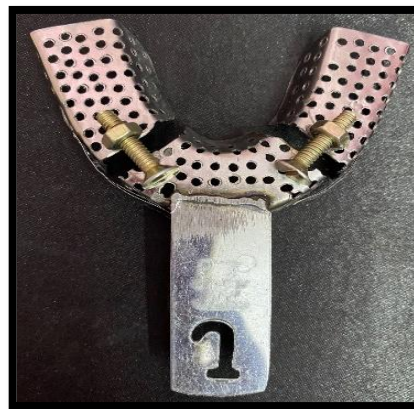
Figure 4: L1 expanded by unscrewing lateral screws