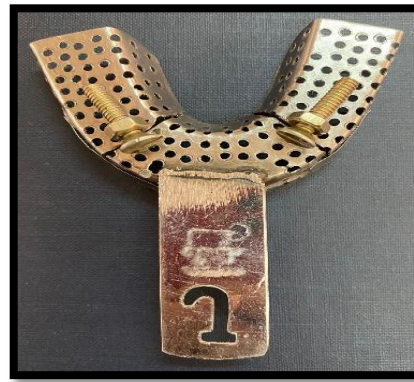
Figure 3: L1 tray with 2 lateral screws